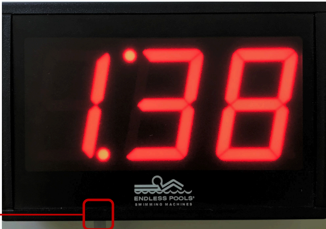
Dip Switch 1 (ON) Position